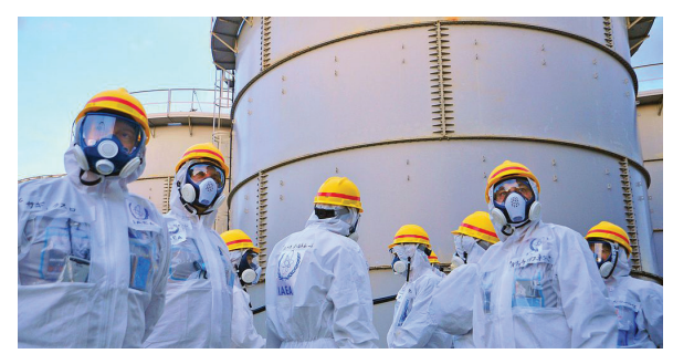
Radioactive water storage tanks are at capacity and some are leaking.

The Fukushima catastrophe has resulted in the release of radioactive fallout into the atmosphere and the discharge of radioactive liquid effluent into the Pacific Ocean. Radionuclides released include cesium 134, cesium 137, strontium 90, plutonium 239, iodine 131 and tritium.