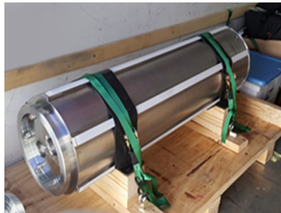
Figure 4. HEUNL Inner Container

NRC staff evaluated the ability of the cask to meet safety requirements under normal and hypothetical accident conditions of transport, including those pertaining to containment of package contents, external radiation levels, and criticality. For example, NRC staff evaluated the package for hypothetical accident conditions using “classical, closed-form calculations and finite element analysis results” and determined a minimum margin of safety of 3.5 for a drop from 9-meters (30-feet) on the bottom of the cask, and a minimum margin of safety of 7.47 for a drop from the same height on the side of the cask. Assuming a hypothetical fire accident as prescribed in NRC and international regulations (see Table 2–1), NRC staff concluded that their evaluations demonstrated a minimum margin of safety of 10 for an increase in internal cask pressure resulting from the fire. Considering all applicable requirements, NRC staff determined that the structural design had been adequately described and evaluated