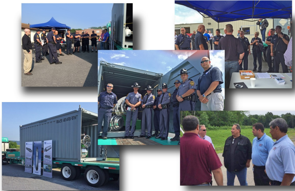
Figure 2. Demonstration Equipment and Attendees

a Summary of training classes and exercises in the listed states in the listed states conducted by DOE from May 1, 2012, through March 18, 2015.