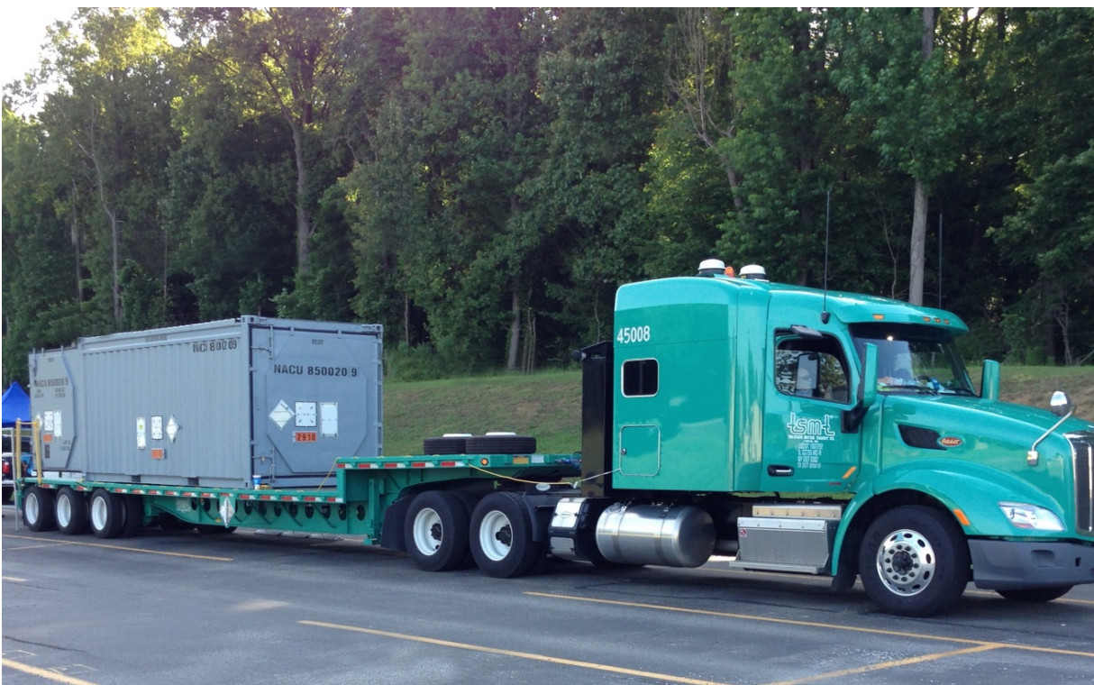
Figure 1. Transport Truck with ISO Container in which the NAC-LWT Cask is Carried

Organization standards (see Figure 1 ). Each truck shipment would transport one large container. The action addressed by this SA could involve up to 150 truck shipments. This is a conservative estimate for the number of shipments to account for uncertainty regarding factors such as the actual quantity of material in each inner container and the flushing rate of the HEUNL from the Fissile Solution Storage Tank.